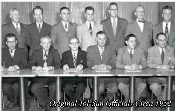
Original Tol-Sun Officials Circa 1952

A timeline of the Credit Union's history follows, but we need your help to enhance it! What memories do you have of the Credit Union? Did you visit Sun Federal in the basement of the Refinery? Are your roots from one of our partners? How has the Credit Union impacted your life? We want to hear and share all of these stories and photos – it's who we are and were – and we hope to keep the legacy alive for future generations of members.